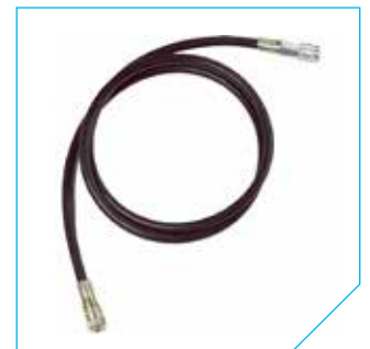
Replacement hoses, spares, service and recalibration