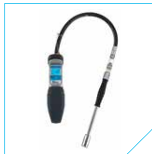
Pressure checking gauges