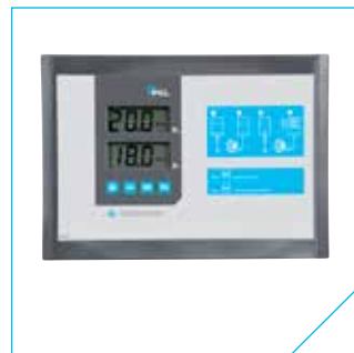
Fixed wall mounted/OEM inflation boxes