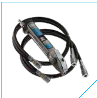
Tyre inflation products